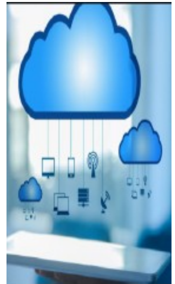
Businesses using cloud storage services

truly made the world a classroom, and all but eliminated the factors of geographical distance and time.