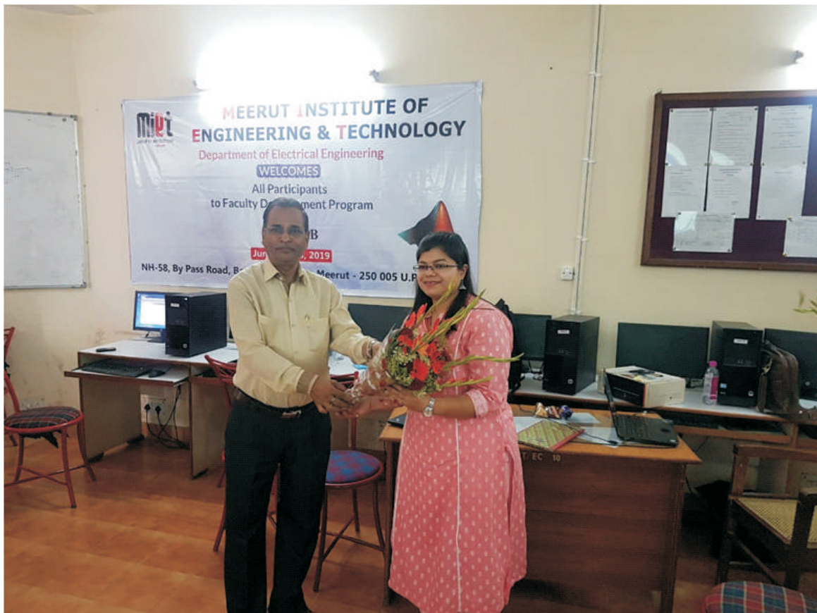
FDP on MATLAB