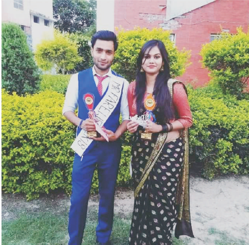
Mr & Miss Farewell