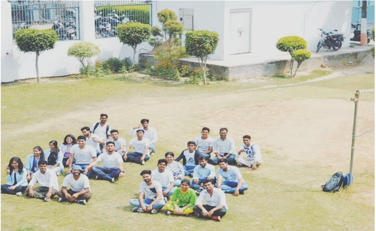
Yoga Day Celebration